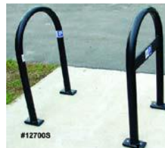
Inverted-U Type Racks