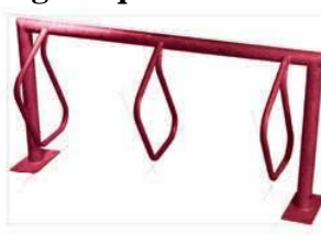
Dero Campus Rack