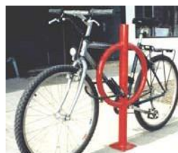
Dero Bike Hitch