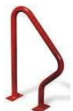
Dero Swerve Rack

If you have questions about whether a particular bicycle parking rack you are considering using meets these requirements, please contact the City of Eau Claire at 715-839-4914.