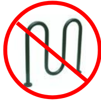
Wave or Ribbon Style racks