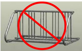
Grid or Fence Style Racks