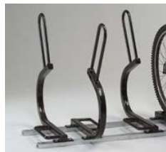
Madrax Sentry Rack