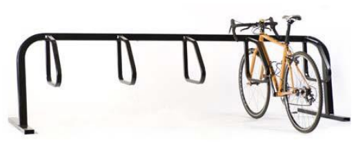
Saris City Rack