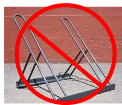
Racks that hold the bike by the wheel with no way to lock the frame and wheel to the rack with a U-lock